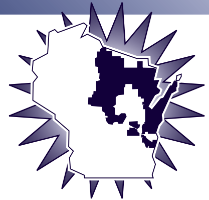
Empowering Successful Partnerships